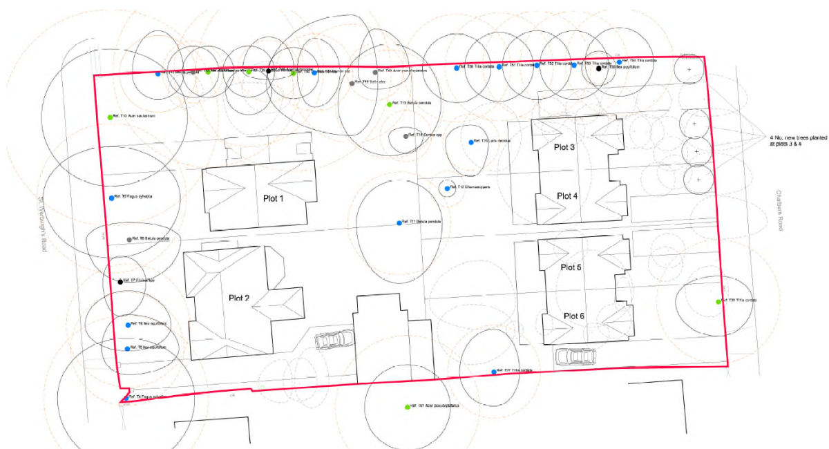
Proposed site layout (St Werburghs Road is to the left and Chatburn Road is to the right)

All of the proposed properties are provided with extensive gardens to the front and rear, which is typical of the area. The overall density of development on the site is 23 dwellings per hectare which, whilst relatively low, does reflect the on site constraints of the trees.